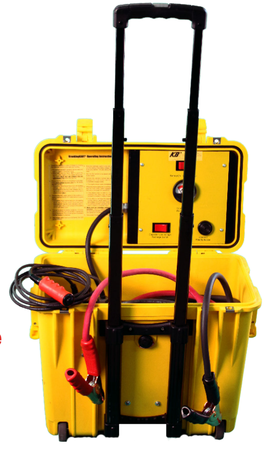
Easily Portable: Only 37 lbs.

Heavy Duty Jump-Start Cart Giving An Engine The Power It Needs To Start.